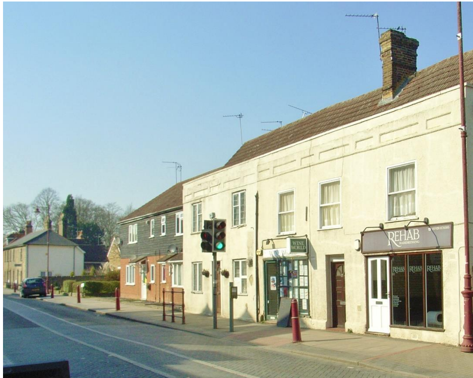
A modern view of the location of the old Blacksmiths shop where the red brick and timber building now stands. The white painted building to the right was a Temperance Hotel for much of the Victorian and Edwardian periods becoming Tea Rooms after 1914.