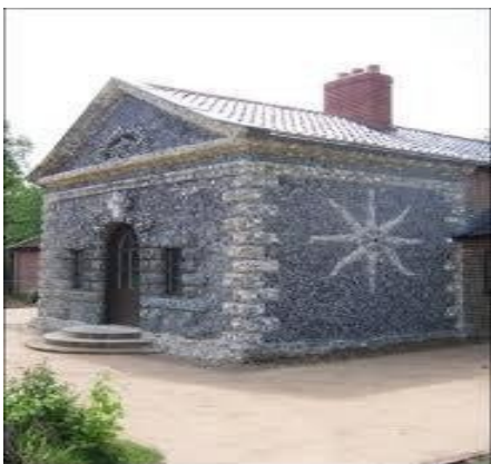
The Shell House, Hatfield Forest

In some instances individual pieces of flint or glass need to be inserted into a wall, a very painstaking task calling for a high degree of skill. One of the properties that we were shown was Berg