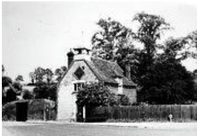
The Clock House formerly the Baesh Grammar School - an early Photograph

Pauper apprentices were helped as it was quite often the case that when they were serving their seven year tenure they could be taken off the parish poor list. Some of the more unscrupulous employers were known to have apprenticed children