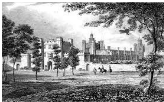
The Palace of Theobalds

Nothing remains of the palace and only one contemporary picture remains, dating from 1653, when it was described as a very princely seat. A plan of Theobalds shows that it was brick built and had two quadrangles